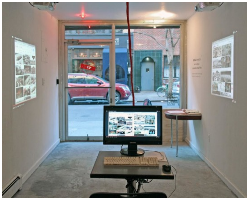
Firewall: Pop Up Internet Café, Orchard Street, New York, 2016

New York City, 917-533-5375, info@firewallcafe.com